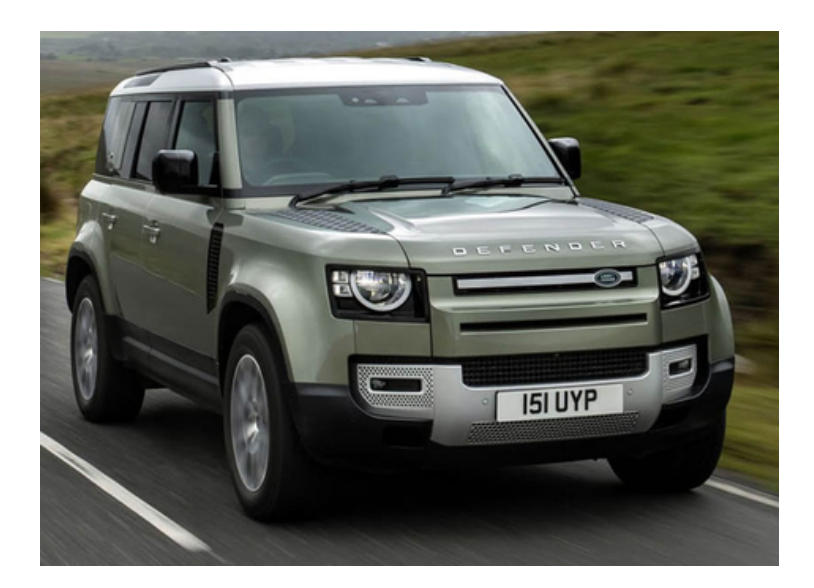
Phan Thiet New Highway